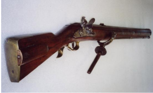
Wall gun produced at Hunter's Iron Works. (Springfield, MA Armory)